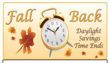
Daylight Savings Time Ends Sunday, November 3<sup>rd</sup>!

The Baby Quilt Ministry will meet at 7 pm on Monday, October 21st.